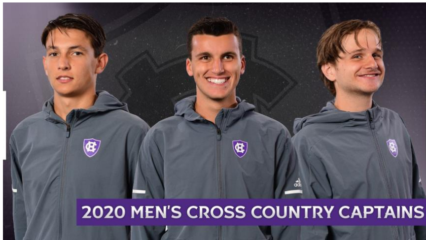
2020 MEN'S CROSS COUNTRY CAPTAINS